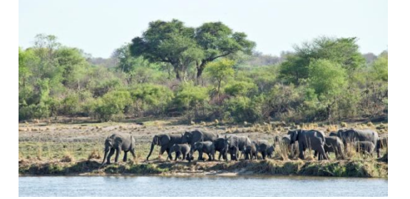
Friday.13<sup>th</sup> – Game cruise. Game drive into Mahangu optional. DB&B

of the Divundu Bridge on the Mahango river just below the Popa Falls. Drive in through a local village, settle in and relax on the wooden deck with a cool drink and, all being well, watching hippos, elephants and other animals in the river or in the Bwabata Park over the water. This is a comfortable Lodge in true African Safari style that also hosts a myriad of birds. DB&B incl.